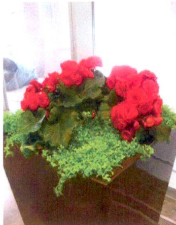
Selaginella are grown for their eye-catching, scale-like foliage and are used for covering pillars, planting in hanging baskets and decorating terrariums.

The naturalistic trend of mixing permanent botanicals alongside live plants is becoming increasingly popular in workplace settings. Permanent botanicals are botanically accurate replica plants made with authentic, dried stems and flowers from natural plant materials or with silks and plastics. Live plants integrated with faux plants offer a creative way to blend artistry, color and style.