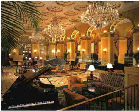
Lobby of the Omni William Penn Hotel in Pittsburgh, PA

perspective, it was also important that the scent is dispersed evenly and not clustered in hot-pockets in certain sections of the lobby."