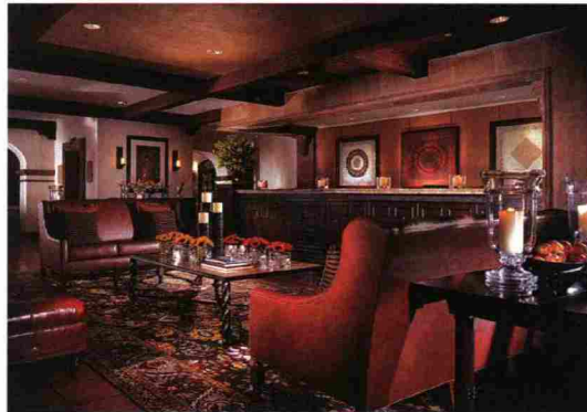
While not being able to put their finger on the origin of the fresh scent in the lobby, most guests attribute the scent to the fresh foliage displayed throughout.

“Our ambient scenting system results in a holistic, inspiring and memorable atmosphere which complements and reinforces Omni’s mission to exceed the expecta-