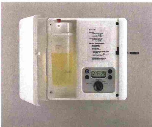
The Ambius system works with ducted HVAC air handling systems.

local profile, we made scent program recommendations. It was important for each property to have scent autonomy as an optimal scent brand.” Each hotel determined