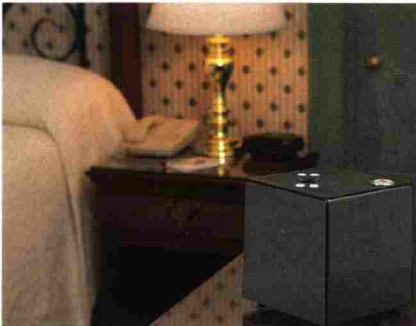
Ambius Cube available in individual guest rooms.

or alertness,” says Snyder. In that vein, Ambius is making individual scent branding units available to members of Omni Hotels’ Select Guest@ loyalty program. “A guest who desires a ‘fresh cotton’ scent or spa-infused ‘green grass,’ for example, can receive on-demand scent branding,” says Snyder.